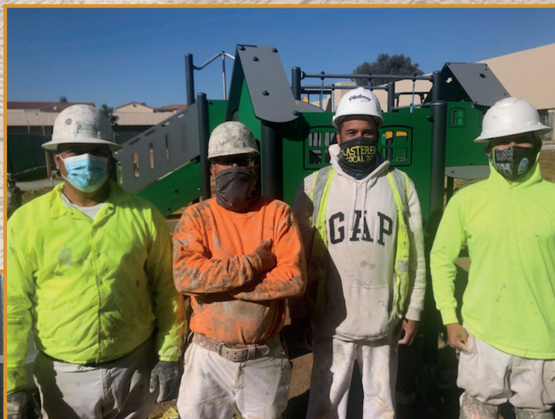
Plasterers from Superior Wall Systems.